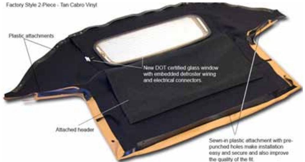
Factory Style 2-Piece - Tan Cabrio Vinyl